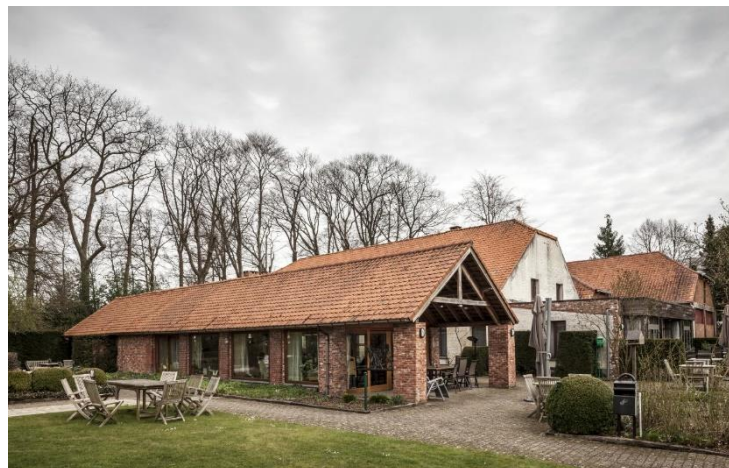
Figure 1. Photo of current hospice; day-care (front) and residential (back) parts.

The old hospice is based in a former farm, surrounded by greenery (Fig. 1 and 2). Patients are addressed as 'guests', a term that fits the ethos of the hospice team and will be used throughout this paper. The residential care part (RC) can accommodate eight guests overnight. The day-care part (DC) welcomes five or six guests per day. These parts are spread over two buildings, positioned a few meters apart (Fig. 2). The inner side of the U-shaped building complex has large windows on all sides. Care is offered by staff and volunteers.