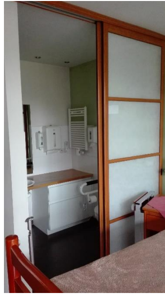
Figure 3. Sliding bathroom door.

In an ideal building, caregivers wish for a small space connected to each private room, to have medical materials right at hand but out of sight. To lift people from their bed or toilet, they prefer using an extra pair of hands rather than mechanical lifting aids. However, the dimensions of the bedrooms or bathrooms sometimes do not allow organizing this smoothly.