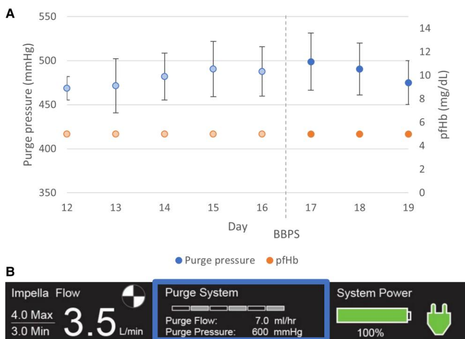
Figure 2 Upper panel: purge pressures (mean \pm standard deviation) and evolution of p/Hb (measurement once daily). Lower panel: Impella™ console indicating purge pressures within normal range (300–1000 mmHg) during support with BBPS.

concentrations have been evaluated (from 5% to 40%) and, for example, a dextrose purge solution of 20% will result in a 40% reduction in flow rates compared to a 5% solution. 10 In April 2022, the manufacturer obtained FDA approval for the use of BBPS for patients intolerant to UFH (e.g. HIT) or in whom UFH is contraindicated due to bleeding complications. This resulted in a simplification of the anticoagulation management because there was no longer a need to account for fluctuating UFH-doses delivered through the device. 11 In a recent retrospective