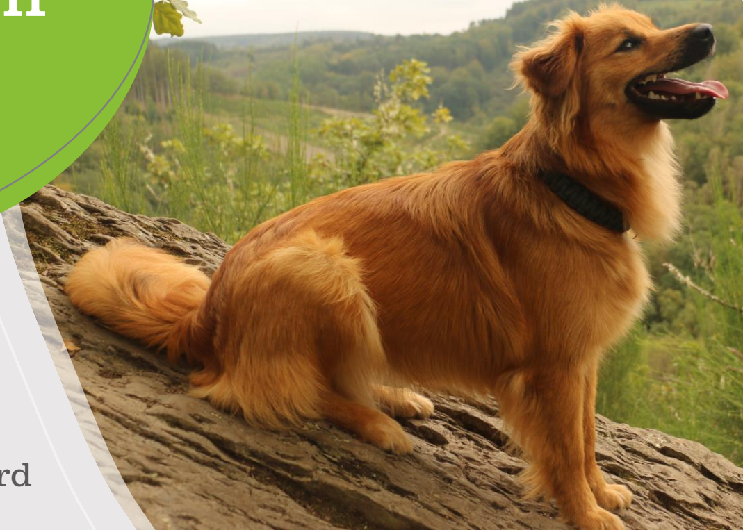
Rafale Pyrenean shepherd

European common glow-worm ( Lampyris noctiluca ) larvae