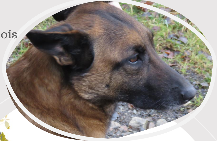
Smokey Belgian Malinois