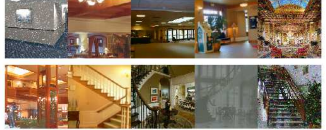
Figure 2: TransPrior user transformations following [7] with severeness three, including: spatters, elastic transformation, saturation, defocus blur, Gaussian noise, brightness, Gaussian blur, jpeg compression, contrast and impulse noise.

each preference 250 extra MITIS images. The 20 evaluation images per category are equally divided over users. All user data is mutually exclusive.