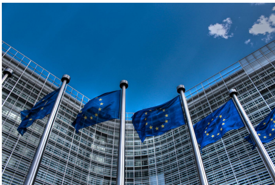
Flags of the European Union in front of the Berlaymont, headquarters of the European Commission, Brussels (Belgium)

“ Es ist von entscheidender Bedeutung, dass die EU eine klarere Vorstellung für die Anfälligkeit ihrer Landwirtschaftssysteme entwickelt und innovative Strategien ausarbeitet, um die Resilienz durch Anpassungs- und Wandlungsfähigkeit zu erhöhen. ”