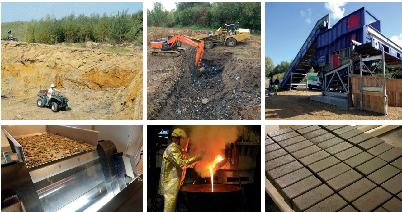
FIGURE 2: Overview of key aspects of the NEW-MINE value chain. Upper part from left to right: Geophysical exploration, excavation and ballistic separation at the Mont-Saint-Guibert landfill in Belgium. Lower part from left to right: sensor based sorting, tapping of slag derived from gasification of the calorific fraction derived from EFM, pavers produced using an inorganic polymer derived from EFM SLAG.