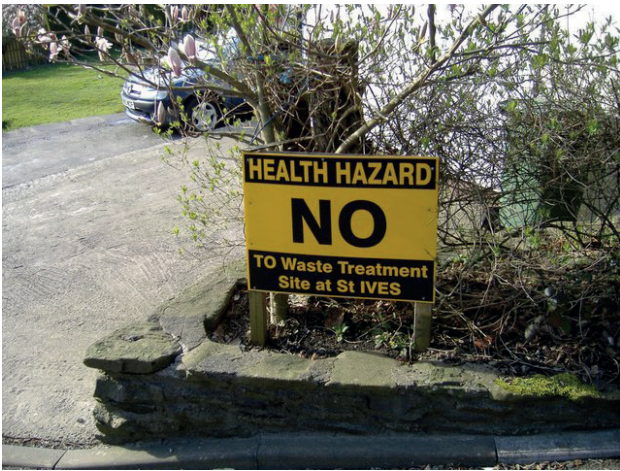
FIGURE 3: Public acceptance as a key aspect in the implementation of an EFLM project.