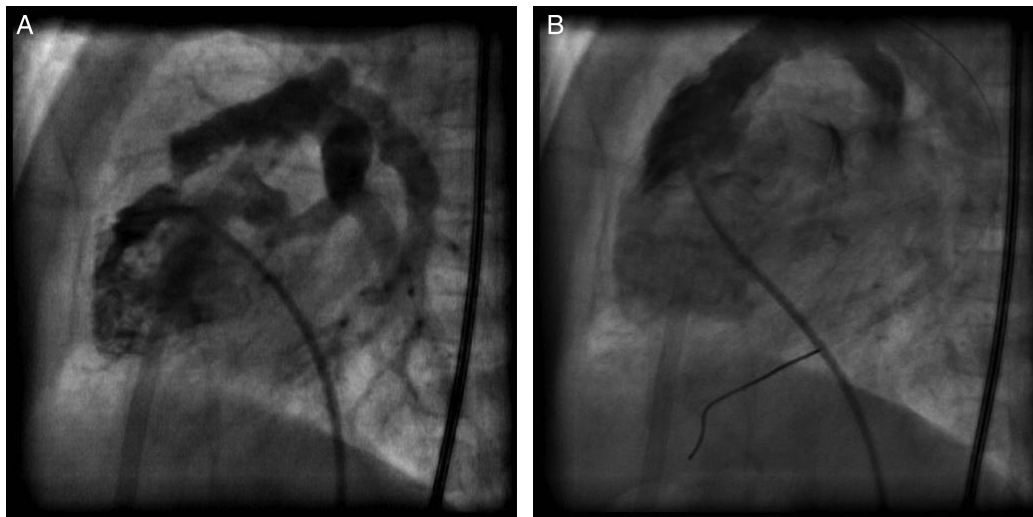
Fig. 2. Percutaneous restent procedure in patient 3 at 3 months. A: RV angiogram showing severe dynamic muscular stenosis proximal of stent in RVOT; (B) RV angiogram showing relief of the infundibular stenosis after restenting.

Prostaglandin infusion was discontinued, if given. The vascular clips were removed and the sternum was closed.