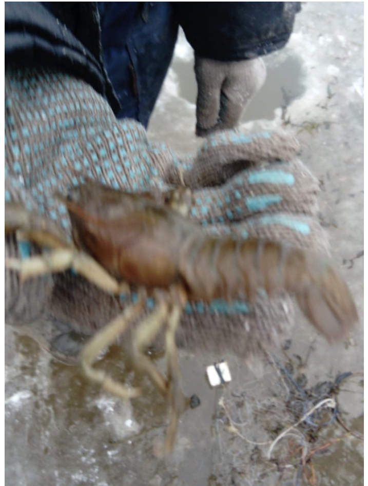
Figure 1. (above) Photo of a freshwater crayfish, collected from the type locality of the presumably extinct Cambaroides koshewnikowi .

Starobogatov, Ya. I. 1995 (published in January 1996). Taxonomy and geographic distribution of crayfishes of Asia and East Europe (Crustacea Decapoda Astacoidei). Arthropoda Selecta , 4(3/4): 3-25.