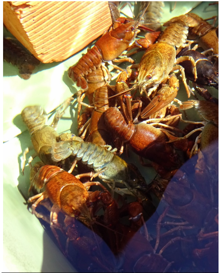
Figure 1. Noble Crayfish ( Astacus astacus ) in a Gotland farm