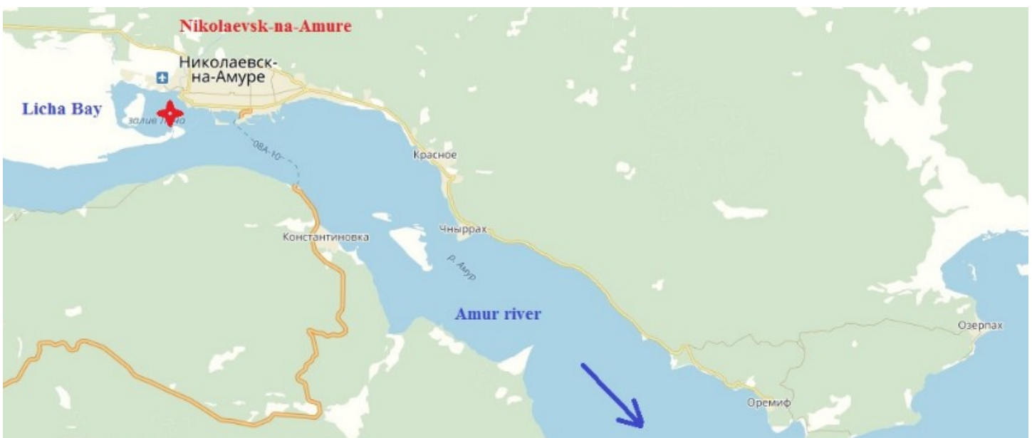
Figure 2. (below) Locality of the freshwater crayfish from Lower Amur, Russia.