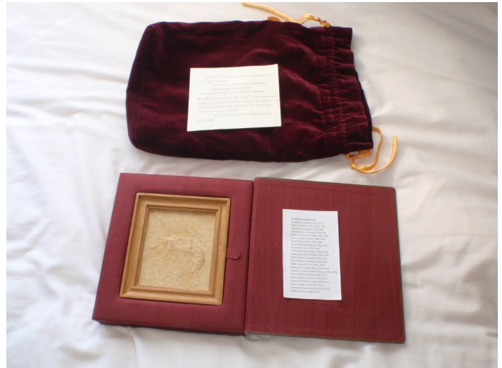
Figure 1. The IAA fossil with its display box, a velvet cover and two pieces of paper.

Because of these new paleontologists joining the IAA, I took a closer look at the fossil of the IAA insignia (Figures 1 and 2). This specimen of a fossil crayfish has been passed on from one IAA president to the next since 1994. More detailed information on this tradition can be found in Crayfish News volume 38(2), in an article written by past IAA president Dr. Susan Adams. The fossil is kept in a solid iron case and housed in a nice display box. The case contains two pieces of paper: one is a list of successive IAA presidents, the other one is an explanation on the fossil crayfish (Figure 3). It is described on the paper that the scientific name of the fossil is Aeger tippularius (Schlotheim, 1822), " Aeger bronni " (sic) (Oppel, 1862), or " Aeger Antrimpos speciosus " (sic) (Münster, 1839), Probably Horton Hobbs would know better and with pleasure (sic) (Figure 2). To tell the truth, there