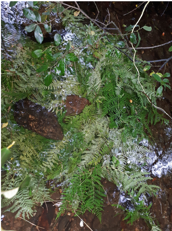
Figure 1. Bracken bundle deployed and weighed down in the river