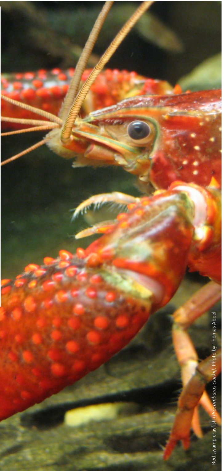
Red swamp crayfish ( Procambarus clarkii ).