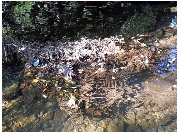
Figure 2. Bracken bundle one month later

Kusabs, IA, Quinn, JM (2009). Use of a traditional Maori harvesting method, the tau kōura, for monitoring kōura (freshwater crayfish, Paranephrops planifrons) in Lake Rotoiti, North Island, New Zealand. New Zealand Journal of Marine and Freshwater Research. 43:3, 713-722, DOI: 10.1080/00288330909510036.