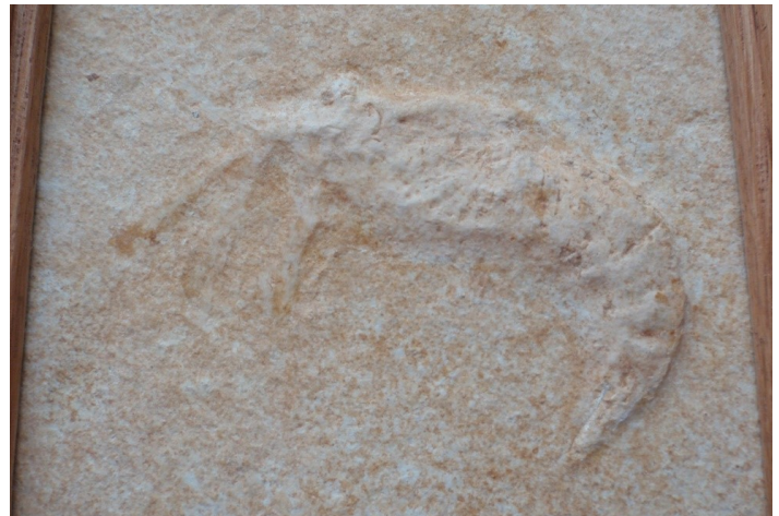
Figure 2. Close-up of the fossil, Aeger sp.