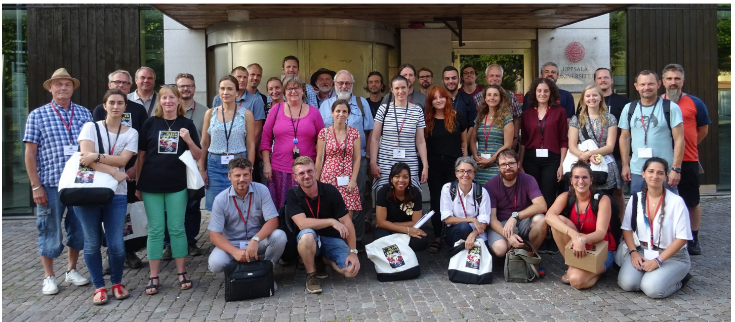
Figure 2. IAA Gotland group picture