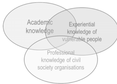
Figure 0.2 Merging of knowledge

This methodology was applied for the in-depth case study of water in Chapter 3. For this purpose, the RE-InVEST team joined forces with pre-existing dialogue processes at grassroots level, conducted by the Belgian Combat Poverty Service and (mainly) the Flemish federation of community work Samenlevingsopbouw Vlaanderen. We thank all parties for their active contribution to this report.