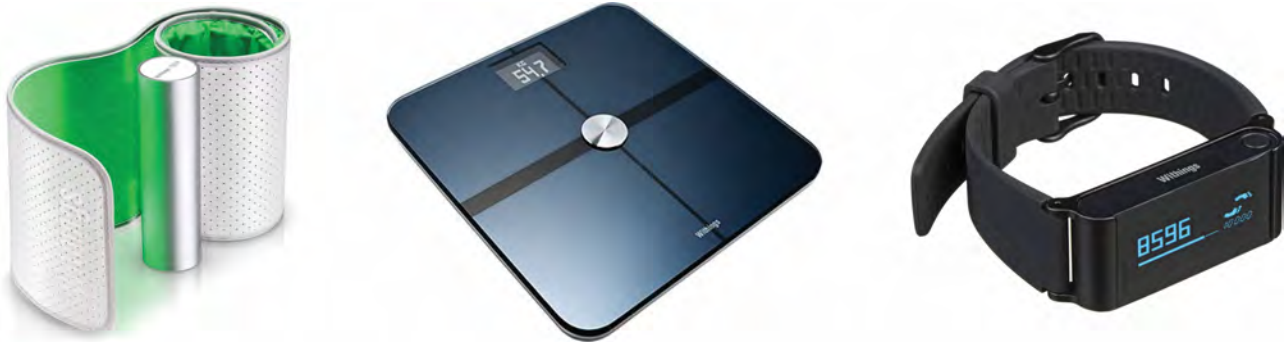
Figure 1. The equipment used in the remote monitoring group.