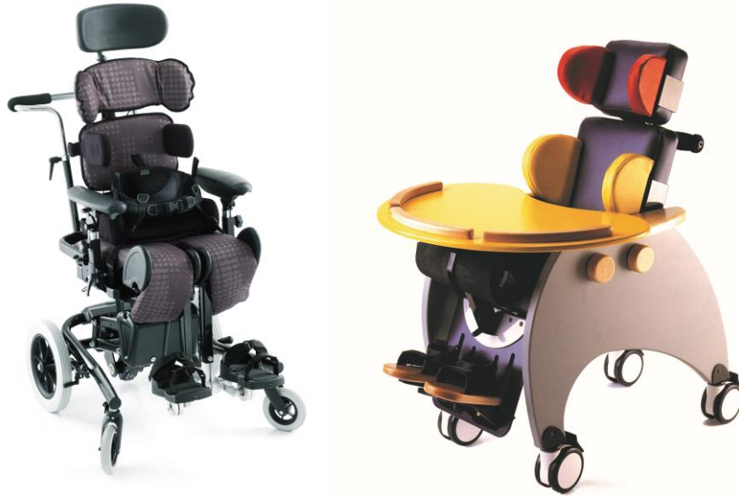
Figure 2. KIT Seating System (left) and Whoosh Chair (right) ©James Leckey Design Ltd.

This seems to provide a solution to what we labelled the paradox of inclusive design approaches. Shifting the understanding of “universal” along the procedural line suggested above, and focusing on the social distribution of usability rather than on the usability of single artefacts, allows for a non-paradoxical understanding of these approaches. According to this understanding, the apparent contradiction between the aim of designing for the widest possible audience and that of taking difference seriously can be treated as raising a question of justice, and confronted by a procedural conception of justice as fairness.