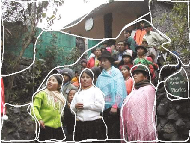
Fig. 2. “About 20 kids in traditional clothing and hats waiting on stairs. A house and a green wall with gate in the background. A sign saying that plants can’t be picked up on the right.” (Color figure online)

used is left open to the participants. Previous research has shown that this task is very challenging [8], particularly given the small set of available training data and we aim to investigate if using the images that accompany textual data can improve the recognition of the spatial objects and their relations. Specifically, our hypothesis is that the images could improve the recognition of the type of relations given that the geometrical features of the boundaries of the objects in the images are closer to the formal qualitative representations of the relationships compared to the counterpart linguistic descriptions.