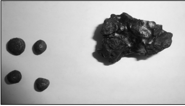
Figure 3. Gastrolith and lead bullets, part of the stomach contents from the Nile crocodile shown in Figure 1.

net in its stomach indicates that it was attracted by the fish caught in the net. The spherical lead bullets had a maximum diameter of 7 to 10 mm. They probably served to injure or kill the sitatunga. The sitatunga is the most widespread bovine in Gabon and is well known in this locality (Christy et al., 2007; Vande weghe et al., 2016). The Rough-head sea catfish Arius laticutatus is common in Ndogo Lagoon and frequently found in nets (Mamonekene et al., 2006). The gastrolith was composed of limonite; it had a maximum length of 35.0 mm, a maximum width of 30.0 mm and a mass of 15.0 g. Although the crocodile individual could not be weighted, it is clear that the mass of this single gastrolith was so small relative to the crocodile's total mass that it was unlikely to serve a hydrostatic function, similarly to what was concluded based on the analysis of gastroliths from Mecistops cataphractus and Osteolaemus tetraspis individuals caught in the same province (Pauwels et al., 2007a, b). This Nile crocodile individual was so exceptionally large for Gabon that it had been reported in popular online media (Anonymous, 2010). Commercial hunting of Nile crocodiles for their skin was very intensive in Gabon until the mid-70s; hunting for their meat still occurs (Pauwels, 2006), and large individuals are rare today.