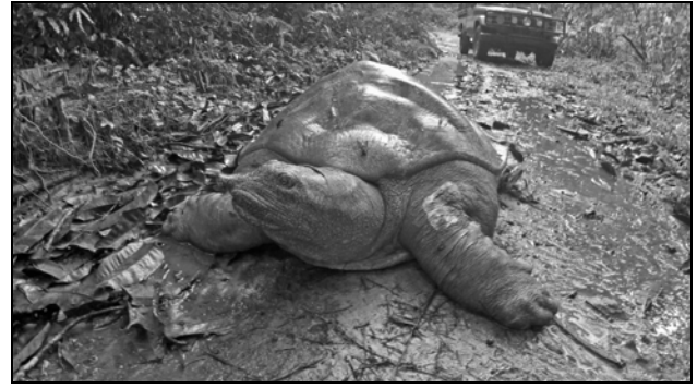
Figure 4. Live adult Trionyx triunguis near Nyonié, Estuaire Prov., northwestern Gabon.

MSNS Rept 119: Iboundji City, Offoué-Onoy Dept, Ogooué-Lolo Prov., Nov. 2012. Caught by day on a house wall in the city. Adult female. SVL 119 mm; TaL > 121 mm (tip missing, healed); 51 midline vertebral scales from midpoint above pectoral region to midpoint above pelvic region (58 to a point above