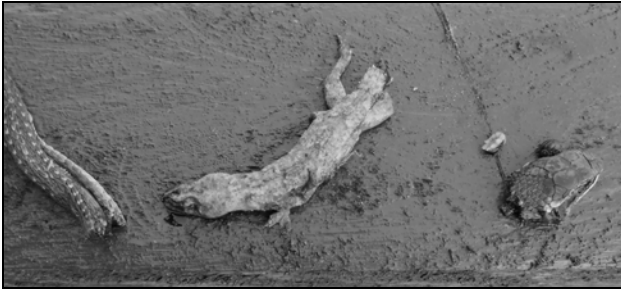
Figure 8. Adult Hapsidophrys smaragdinus in Nyonié, Estuaire Prov., killed with a machete, with one of the three adult Hemidactylus mabouia its stomach contained. On the right side lies the head of the snake.