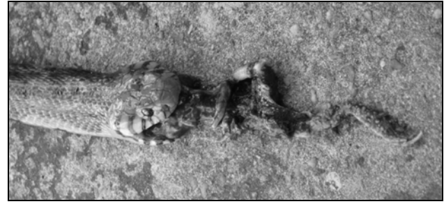
Figure 9. Adult Naja melanoleuca regurgitating a Sclerophrys regularis in Gamba, Ogooué-Maritime Prov., southwestern Gabon.

MSNS Rept 243: Ipassa, Ivindo NP, Ogooué-Ivindo Prov., 24 June 2016. Caught by one of us (PC) at 20:45 on a branch at one meter above the ground in secondary forest along a road. Temporal formula 2 + 2 on each side. Vertebral row widened. SRR from 19 to 17 occurs above V 149 (left) and 146 (right) by fusion of rows 3 and 4 on each side; from 17 to 15 above V 150 (left) and 147 (right) by fusion of row 8 with vertebral row on each side. This is the second specimen recorded from Ivindo NP. Like the first one (Carlino and Pauwels, 2015) it has 19 DSR at midbody; Pauwels and Vande weghe (2008) had only recorded Gabonese specimens with 21 DSR at midbody. Based on the extensive molecular phylogeny by Figueroa et al. (2016) we accept the allocation of the African species previously referred to Boiga by us and other authors to Toxicodryas .