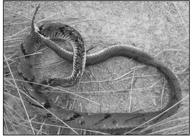
Figure 11. Adult Causus lichtensteinii found dead in Wonga-Wongué Presidential Reserve, northwestern Gabon.

One of us (LC) examined the photograph of an individual of this species taken by an ecoguard at the Camp Présidentiel (0.47736 S, 9.59067 E) in Wonga-Wongué Presidential Reserve, Ogooué & Lacs Dept, Moyen-Ogooué Prov. in June 2014. The same month LC observed another individual at the Camp Présidentiel. Their typical stout habitus, round pupil, blotched dorsal pattern