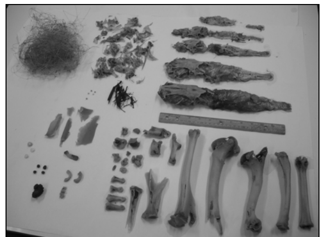
Figure 2. Stomach contents from the Nile crocodile shown in Figure 1. The ruler is 30 cm long.