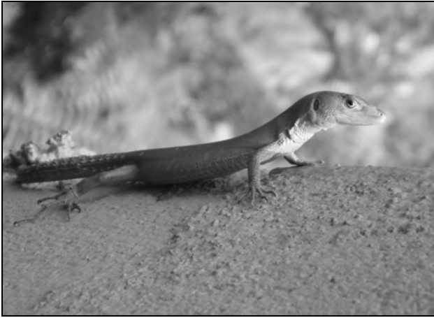
Figure 5. Live adult Gastropholis echinata photographed by an ecoguard in Wonga-Wongué Presidential Reserve, northwestern Gabon.

the road in Kango, Komo Dept, Estuaire Prov. New locality record (Pauwels et al., 2002b). LC also examined an individual in Ayémé-Maritime, Komo-Mondah Dept, Estuaire Prov., on 27 Dec. 2015. New locality record (Pauwels and Vande weghe, 2008).