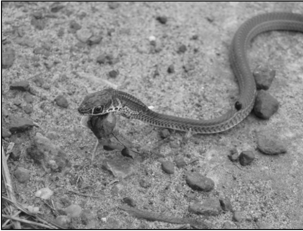
Figure 10. Juvenile Psammophis cf. phillipsii eating an adult Phrynobatrachus auritus in Gamba Oil Terminal, Ogooué-Maritime Prov., southwestern Gabon.