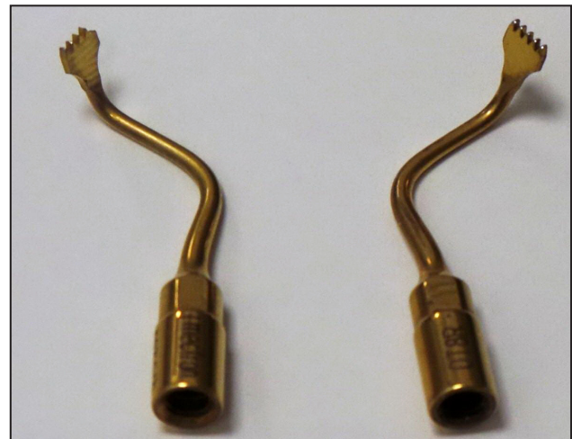
Figure 3. Bi-angulated Piezzo ultrasonic head used for coronal sectioning.

to make a horizontal cut through the tooth at the level of the cemento enamel junction. Sectioning of the crown was performed without perforation through the lingual bone plate. The crown was delicately fractured and separated from the residual roots of the tooth using a straight elevator or chisel. Effort was directed at minimising any mobilisation of the residual roots. Upon removal of the crown, any sharp fragments of the retained tooth structure were smoothed using a diamond round bur with simultaneous copious saline irrigation.