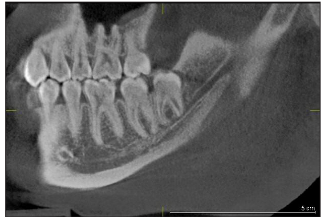
Figure 2. Multi-planer reformatted view of CBCT shows a close relationship between the impacted mandibular third molar roots and vital structures.

A full thickness mucoperiosteal incision was elevated with posterior buccal release. A conservative buccal trough was created using a round carbide bur on a surgical handpiece to allow access to the cemento enamel junction of the tooth. Care was exercised to maintain as much crestal bone height as possible by minimising the width of the buccal trough. After exposure was obtained, a Piezzo ultrasonic instrument with angulated head (Figure 3) was used