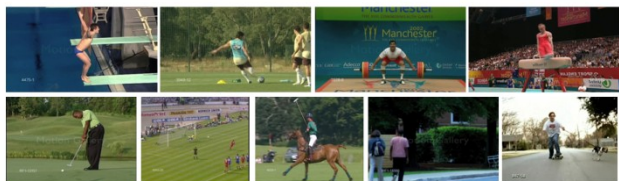
Figure 3: Some video frames of the UCF sports action dataset.

Following the leave-one-video-out experiment setting in [32], the proposed LDL could achieve 95.7% recognition accuracy, better than the state-of-the-art action recognition result (e.g., 95.0%) reported in [32].