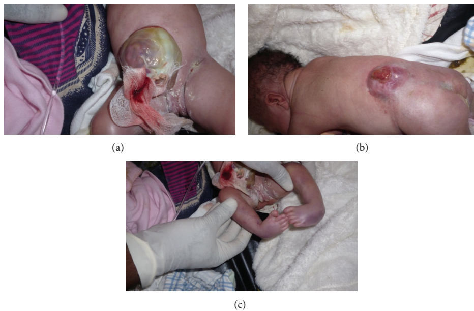
FIGURE 2: Other features: note (a) exomphalos, (b) meningocele, and (c) bilateral club feet.