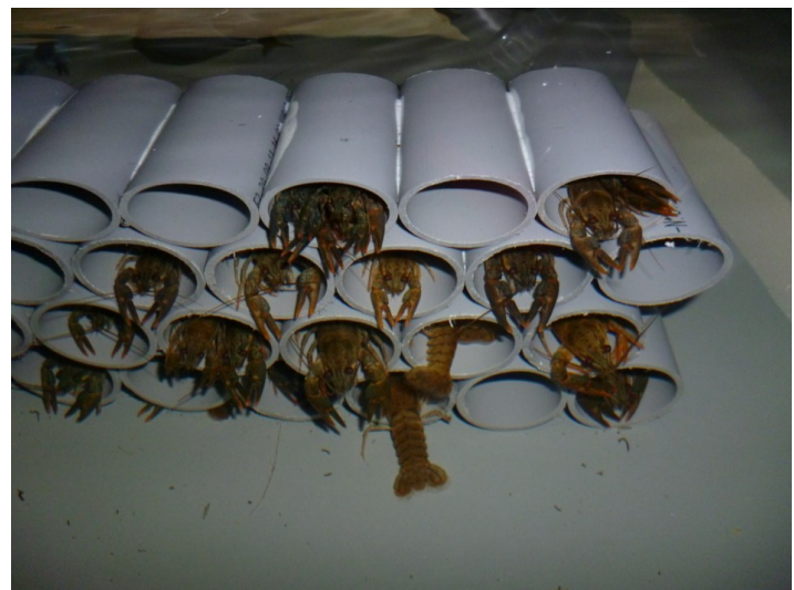
Photo 3. One summer old noble crayfish in their hiding places