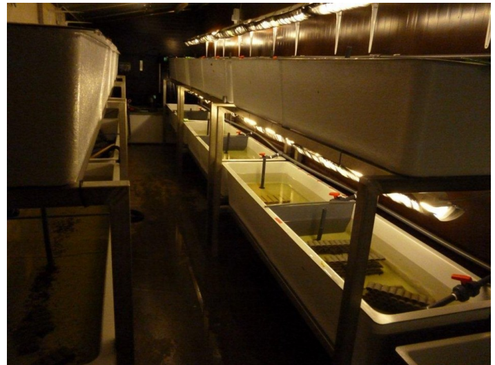
Photo 1. The crayfish tanks at the Aqua-ERF research facility.