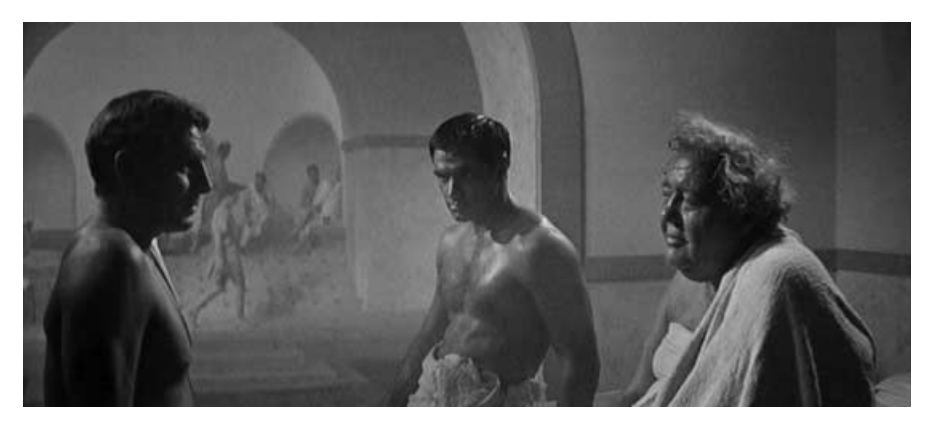
Figures 1–2. Spartacus: The container image schema

fered by a scene from Spartacus (1960). The film shows Julius Caesar (John Gavin) in a Roman bath while he is conversing with patrician and strategist Marcus Licinius Crassus (Laurence Olivier). The men are opposite each other and depicted without interference of cutting. Crassus fills the left side of the filmic space, Caesar the right. Crassus has decided to manipulate Caesar in order to get rid of his political opponent in the Senate, the hedonist Sempronius Gracchus (Charles Laughton). When later on Gracchus joins the conversation, the mise-en-scène is adjusted. Caesar moves toward the neutral center of the screen, flanked by the two sides between which he will have to choose (Figure 1). Then Crassus leaves the scene, emptying the filmic space he was occupying. Caesar then rises and puts himself opposite Gracchus, thus occupying the same space (or container) that was inhabited by Crassus (Figure 2). Where his position had been neutral before, he has now chosen a side. This change in the state of affairs is confirmed by a play with shot-reverse shots. Both men no longer fill the same filmic space (container). As such, the concrete (in this case our shared physical experience of in and out) is metaphorically extended and used to express the abstract political machinations of the corrupt Roman aristocrats. In other words, the image schema of a container functions as a solution to the problem of how to express political power struggles cinematically.4