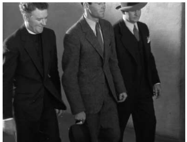
Figures 3-4. You Only Live Once: The balance image schema