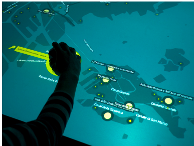
Figure 3: Tangible geo-visualization in Venice Unfolding

How can we exploit novel opportunities in mobile devices for supporting communication and collaboration between learners and with teachers, which is especially relevant in a Computer Supported Collaborative Learning (CSCL) setting, the more so as these devices can capture context information.