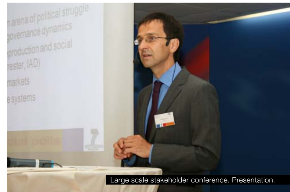
Large scale stakeholder conference. Presentation.

Intervention capacities of the state in the spatial lay-out of cities are increasingly hindered by the fact that urban land and buildings are the object of global capital investment and speculation. Research is needed to uncover the processes leading to increasingly unbearable housing costs. We should also think of redistribution measures that translate the value of the city into inhabitant and user rights to the city and that re-open possibilities of creating urban socio-spatial structures that foster social cohesion. In relation to this, Alain Storme urged for more research on urban growth coalitions and their role in urban development programmes. Conversely, Anne Querrien drew attention to the objective alliance between big property owners who push housing prices up and small property owners who benefit from this rise.