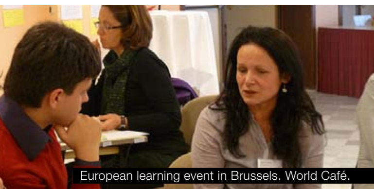
European learning event in Brussels. World Café.

A new theoretical and methodological approach is of vital importance to achieving socially cohesive and socio-ecologically sustainable urban policies and strategies. Recent academic advances suggest that the urban socio-ecological condition needs to focus on processes of urban socio-ecological metabolism, the uneven spatialities of these processes and the complex interactions between movements of people, non-human agents, and commodities on the one hand, and the transformation of the social and ecological conditions in cities on the other.