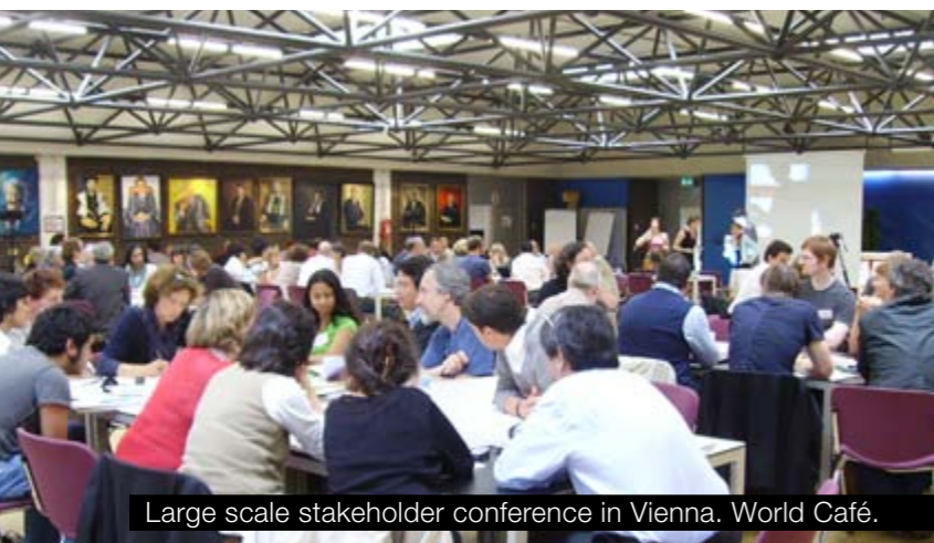
Large scale stakeholder conference in Vienna. World Café.

Over 300 stakeholders were brought into multilayered and plural debate, including researchers, prominent EU, UN, national government and local