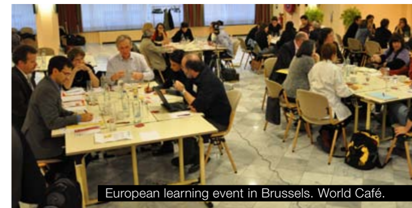
European learning event in Brussels. World Café.