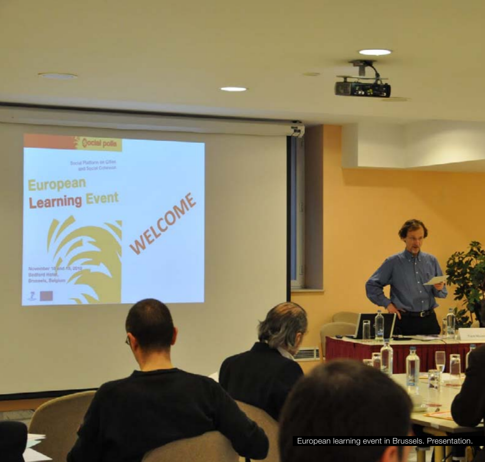
European learning event in Brussels. Presentation.

Proposals for the EC FP7, SSH research agenda: the 'Focused Research Agenda'