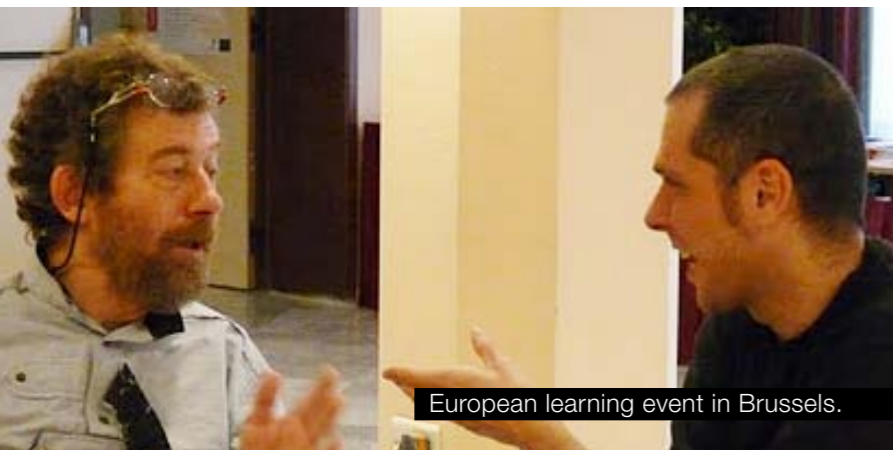
European learning event in Brussels.

Research needs to be more comparative. Systematic reflection should be dedicated to context-sensitive good practice examples and knowledge transfer in order to foster social cohesion. How can we devise analyses of context-specific strategies towards social cohesion in a path-sensitive way, which would also permit policy recommendations for other contexts (comparability, cross-city learning)?