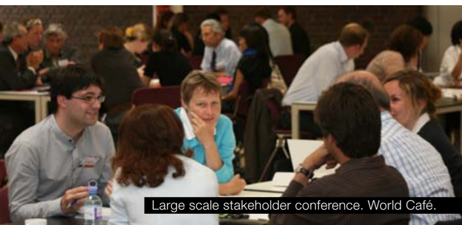
Large scale stakeholder conference. World Café.

their urban realities. To bring the macro- and micro-level of agency into the dialogue, research should focus on analyzing the effects of global structural change in the social morphology of cities, as well as studying its relations with the production of urban social policy and the attention given to bottom-linked strategies aimed at overcoming social exclusion. With the erosion of the welfare state “space and place” have regained importance for the inhabitants of