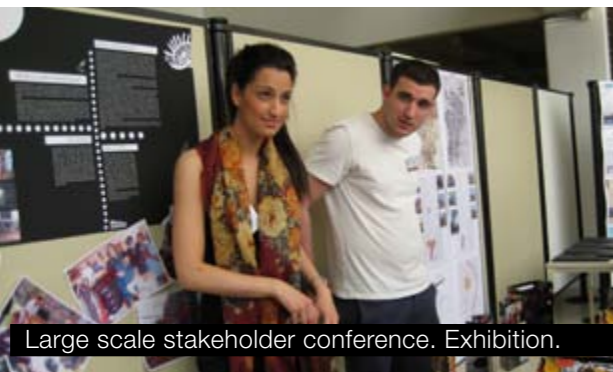
Large scale stakeholder conference. Exhibition.

actors should be provided. Secondly, an interdisciplinary gender perspective should be applied when doing research on social exclusion, and gendered experience of exclusion should be collected and analyzed so that new variables, new themes and new dimensions emerge as a result. Thirdly, in order to provide a better understanding of the multilevel processes involved in the production of social exclusion and social cohesion, research concepts and tools should prove adequate and sensitive to different scales of analysis.