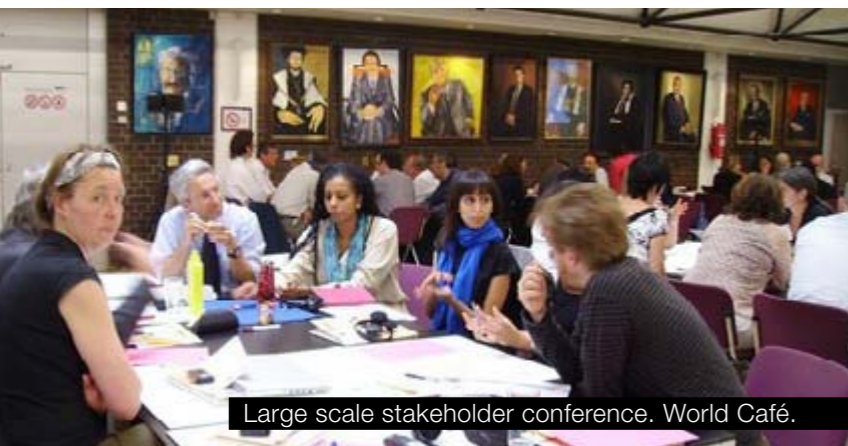
Large scale stakeholder conference. World Café.

Research must focus on the empirical value of Florida's discourse on the "creative city" as well as on the effects of the application of its resulting strategies on social cohesion. Also alternative strategies and practices formulated by researchers and cultural groups opposed to Florida's discourse should be studied. Research must also verify whether those actions and reactions can constitute the basis for an alternative discourse on the creative city. The validity of alternative strategies should be documented empirically with in-depth case studies at the borough level.