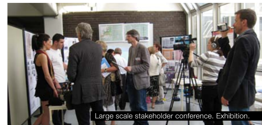
Large scale stakeholder conference. Exhibition.

Systematic comparative research is needed to map the fragmentation of civic and political rights in cities and to evaluate the negative consequences of the lack of these rights, and also to show how the relationship between citizenship practices and urban governance is featured in different contexts. Moreover, empirical research in this regard would illustrate the ways in which some cities are able to promote ways of providing civic, social and political rights for vulnerable social groups and immigrants.