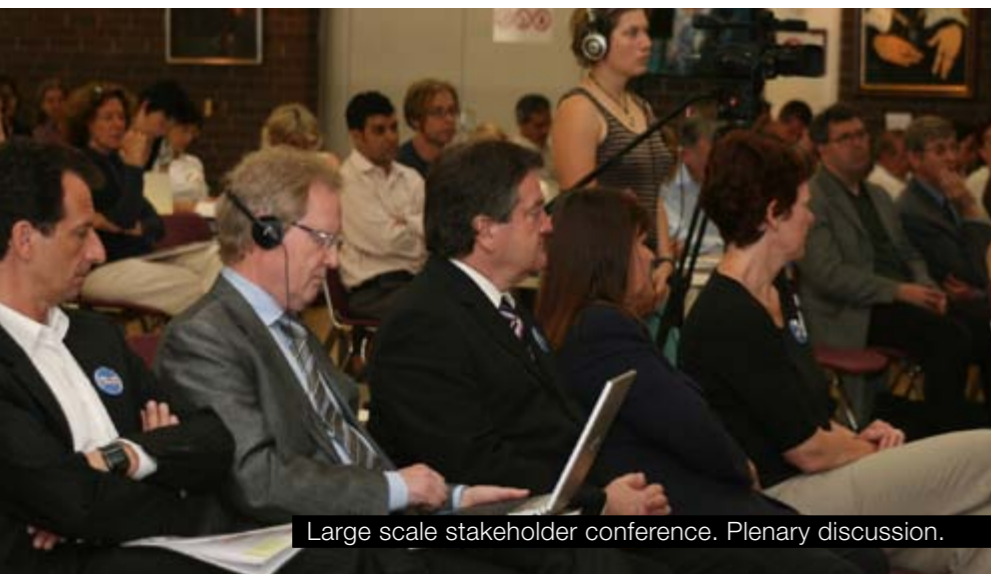
Large scale stakeholder conference. Plenary discussion.

There are studies that look at the implementation of policies and policy packages for sustainable mobility and social inclusion. However, much of this work searches for generic lists of policy mechanisms, barriers to implementation and resorts to best practice exemplars. This is helpful but does not ring true in many policy contexts due to the diversity of urban contexts and the lives within them across Europe. We would argue for research that is more sensitive to the socio-political contexts for socially cohesive mobility policies. There are also close connections here to our security agenda: if citizens do not feel secure on transport networks then they will remain excluded from services, education and job opportunities. There is surprisingly little cross-national research into this area. In addition, twenty-first century hypermobility has implications for the routine surveillance of different types of public space and thus for feelings of security in the city of citizens. Again, this area is under-explored.