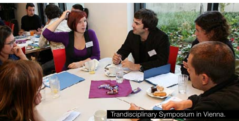
Transdisciplinary Symposium in Vienna.

Research topics would address what sort of local articulation of supply of services is emerging in the different local contexts, and which is the most favourable to social cohesion, looking both at the institutional organisation of the services and at the population. How does the presence of the different providers affect access to and quality of services, contributing to the reduction or reproduction of inequalities in that local context? This means examining which social groups have access to which services, who in which groups is excluded, and how these groups differ in different local contexts. How do the different providers interact and change their working rules in the presence of other actors? How does the presence of different providers and the organisations to which they belong affect the emergence of the grey market? And how does it affect the informal care, mainly given by women, within the household, or the proximate social support network?