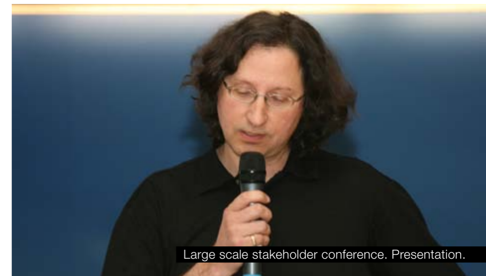
Large scale stakeholder conference. Presentation.

The role that cities play in terms of sustaining economic and occupational restructuring, in concentrating and centralising resources as well as mobilising outlets for profitable investment in real estate and infrastructure, would be another key issue to be explored. The incomplete theoretical development of existing accounts of "elevator" and "incubator" regions, "creative" and "global" cities implies a need for more sophisticated research on the role of locational factors, state strategies, agglomeration economies and urban scale in determining competitiveness and profitability. In this context, it is important to include public as well as private actors in the analysis of urban transformations. As far as labour market policy is concerned, it is important to evaluate the impact and prospects of activation policies in different socio-economic contexts and to reflect on the policy lessons that can be drawn from different experiences in this field.