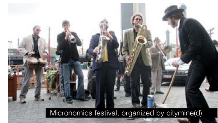
Micronomics festival, organized by citymine(d)

The research should aim to break the dichotomy of traditional dualistic analytical frameworks and to regard the plural economy as an opportunity. It should be inter- and trans-disciplinary. In addition, research must develop and adopt a working definition of a ‘plural urban economy’. A socio-economic approach is recommended to analyze strategic sectors . The role of institutional processes should be at the heart of the analysis. Through case studies , research should analyze the institutions, agencies and conditions which have had (an historical perspective ) and may have (foresighting methods) significant impacts on a plural urban economy. The role of multiscalar institutional processes and conditions of multi-level governance of the plural economy should be studied. Analysis of different scales of income should identify the plurality of an urban economic system. Research should also develop possible criteria and indicators for assessing the effectiveness and performance of the plural economy . We do not wish to preclude successful tenderers developing appropriate research methodologies, though we particularly welcome hands-on active learning/ABCD-based approaches and partnership based research , which mobilize policy makers, citizens and stakeholders as participants of the research process.