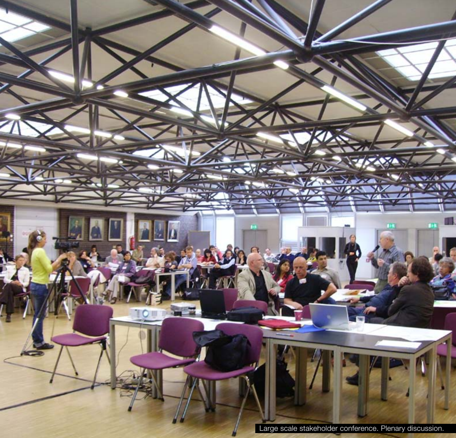
Large scale stakeholder conference. Plenary discussion.