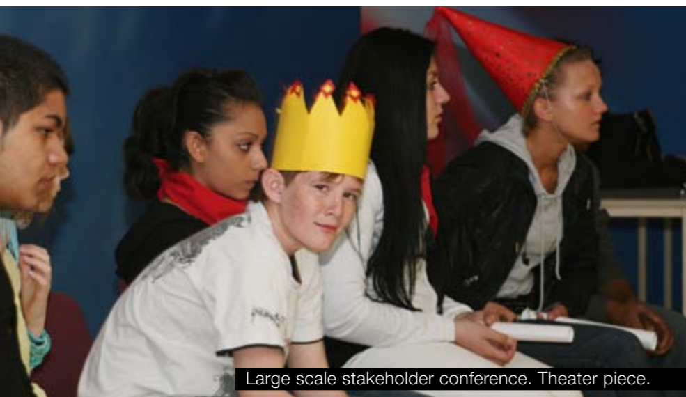
Large scale stakeholder conference. Theater piece.

Overall, research needs to confront the tendency to separate politics from policy-making through consensus building processes. Representative and deliberative practices in local democracy need to be studied with emphasis on the failure of representative forms of democracy to integrate the deliberative practices of civil society groups. It is necessary to mention research on the role of social sciences in participatory democracy (consultation processes, expertise, evaluations, etc.) and on the role of EU legislation in stimulating participatory democracy (e.g. revitalization programs). How do cities deal with governance issues in relation to competitiveness/cohesion? It is necessary to stress the role of governance as a mediation mechanism between the ways in which particular interest groups versus citizens' proposals construct cities.