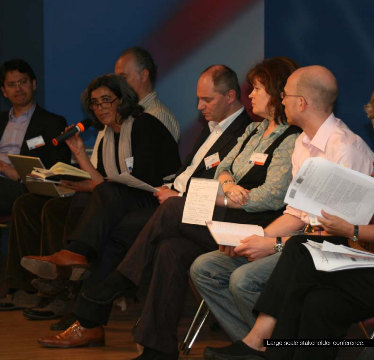
Large scale stakeholder conference.