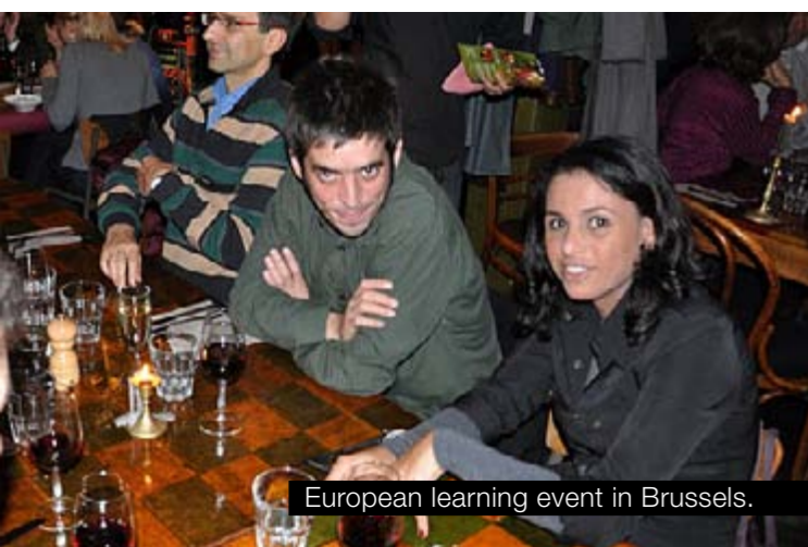
European learning event in Brussels.