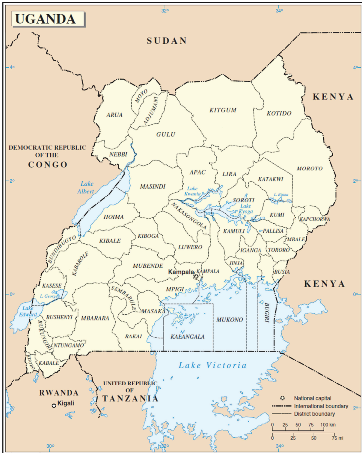
Figure 1: Administrative map of Uganda