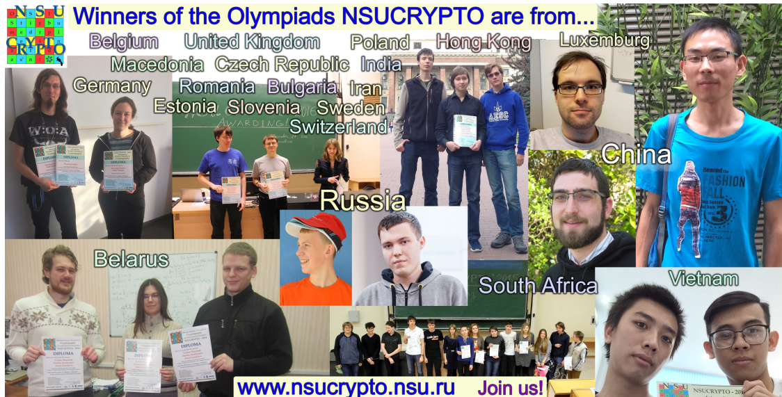
Figure 5: The NSUCRYPTO winners of different years.