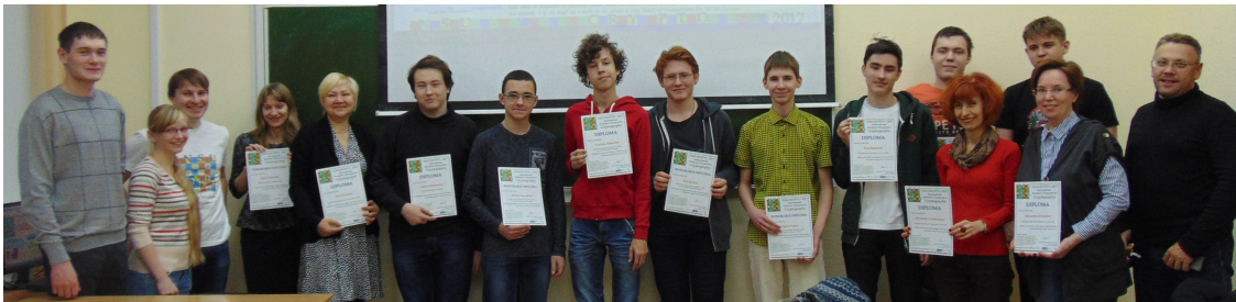
Figure 4: Awarding ceremony at Novosibirsk State University, December 2017.

Here we list information about the winners of NSUCRYPTO’2017 (Tables 5, 6, 7, 8, 9, 10).