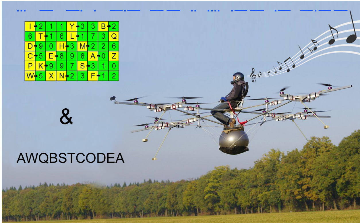
Figure 2: Illustration for the problem “A music lover”