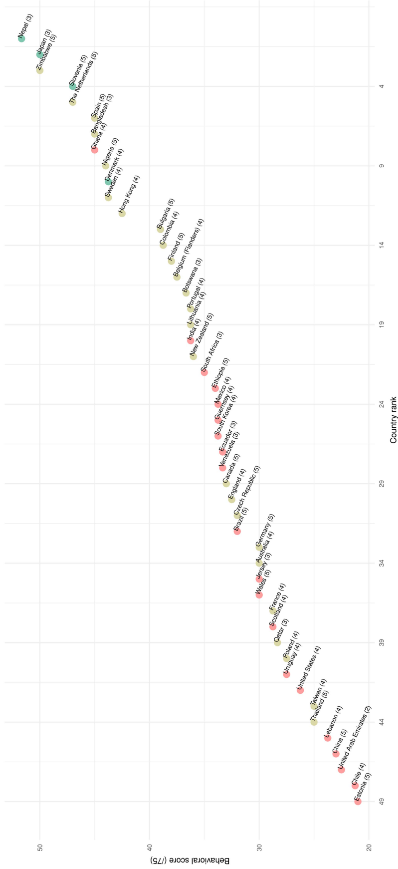
Figure 2 — Plot of the behavioral score estimated for the 49 countries of the Global Matrix 3.0. Note: The behavioral score was adjusted for missing and incomplete grades. The number in parenthesis shows the number of grades available for the calculation of the score.