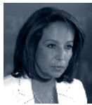
Anna Diamantopoulou President, Diktio Network, former Minister of Development and Competitiveness, Greece, former EU Commissioner for Employment and Social Affairs, and Trustee of Friends of Europe