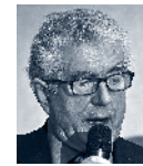
Rhodri Morgan Chancellor, Swansea University, and former First Minister of Wales