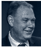
Aart Jan De Geus Chairman & Chief Executive Officer, Bertelsmann Stiftung, former Deputy Secretary General, OECD, and former Minister of Social Affairs and Employment, The Netherlands