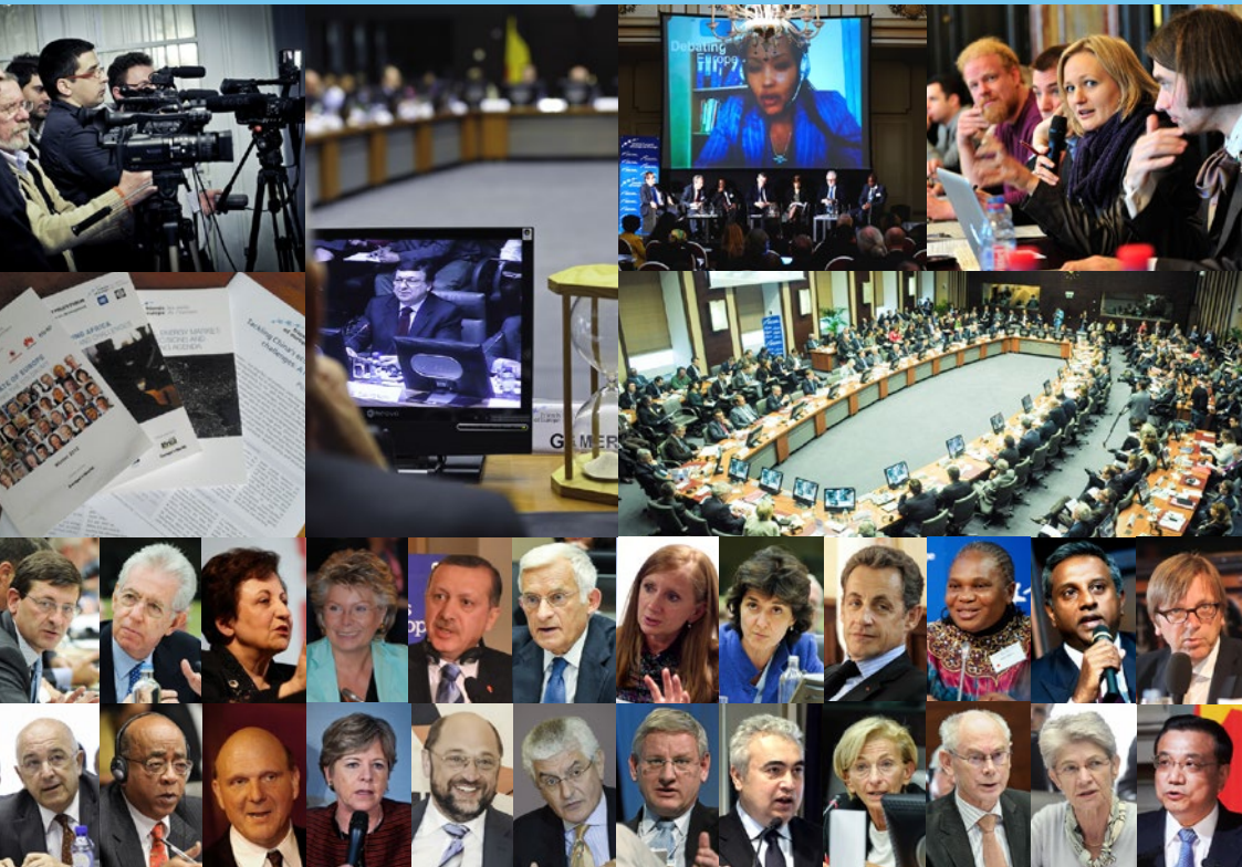
Some of the familiar faces and household names who have used Friends of Europe's high-profile yet neutral platform to put across their ideas to decision makers and to public opinion

Future Europe | Smarter Europe | Greener Europe Quality Europe | Global Europe | Security Europe