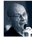
Pascal Lamy Former Director General, World Trade Organization, former EU Commissioner for Trade, and Trustee of Friends of Europe