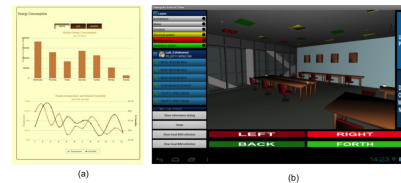
Fig. 2. Developed (a) web portal and (b) smartphone application

In addition the smartphone application shows this information exploiting both Virtual and Augmented Reality.