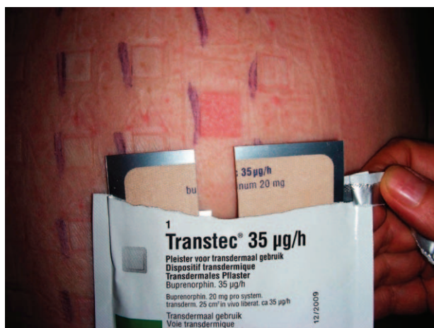
Fig. 1. Positive test (++) to the Transtec ® transdermal delivery patch (transdermal buprenorphine) (case 1).

The patient was tested with the European baseline series (Trolab ® ; Hermal, Reinbek, Germany), TDB and the placebo transdermal delivery system (PTDS) as provided by the manufacturer, and additional allergens. Positive reactions were observed to TDB (+ D2 and ++ D4) (Fig. 1) and Myroxylon pereirae (balsam of Peru) (+ D4), the latter for which no relevance could be found. Testing with PTDS in this patient and with the TDB in three controls was negative. As an alternative for the Transtec ® patch, fentanyl TDS (Durogesic ® ; Janssen-Cilag NV, Berchem, Belgium) was started and the patient has since remained pain and lesion-free (contacted by telephone).